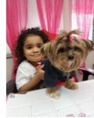
2021 Our partnership with Birchbark this year helped a small dog named Tuffy who was rushed to the Pacific and Santa Cruz Veterinary Specialist.