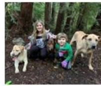
2023 Sunshine (far right) received surgery for a pyometra from Santa Cruz Veterinary Specialist